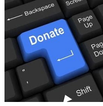
Donations Needed Now