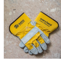
Volunteer Needs & News