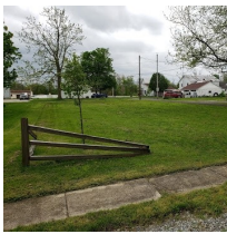
Elida Build Update