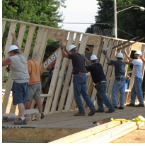
Elida Build Update