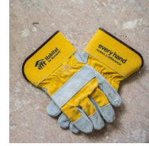
Volunteer Needs & News